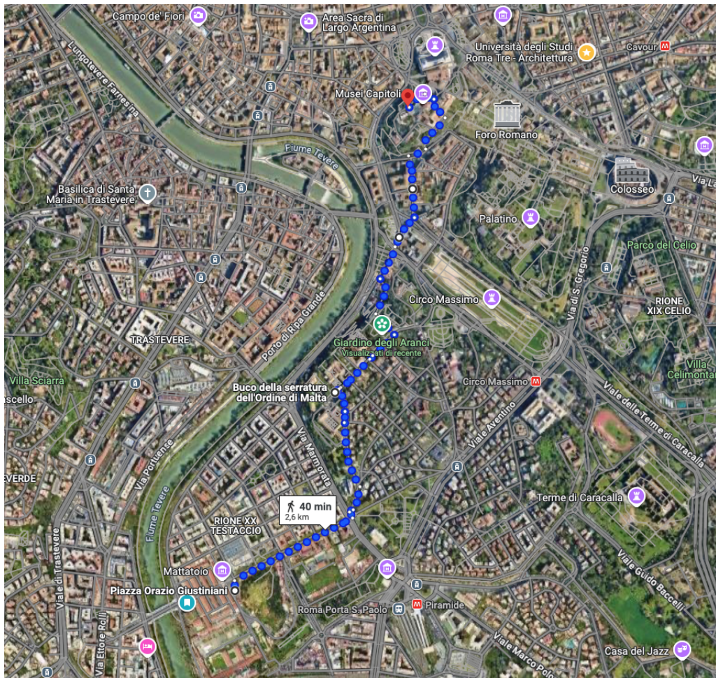
Figure 1: Directions to Terrazza Caffarelli